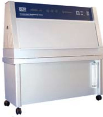
The QUV is the world's most widely used weathering tester.