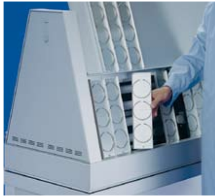
Test specimens are mounted in convenient snap-ring holders.