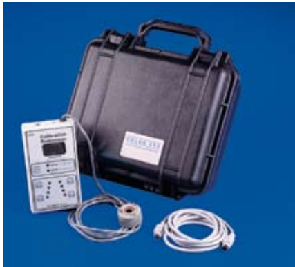
Calibrations with the CR10 Radiometer take only minutes and comply with ISO 9000 requirements.

In addition to its other advantages, the patented Solar Eye system allows for easy calibration and traceability for ISO compliance.