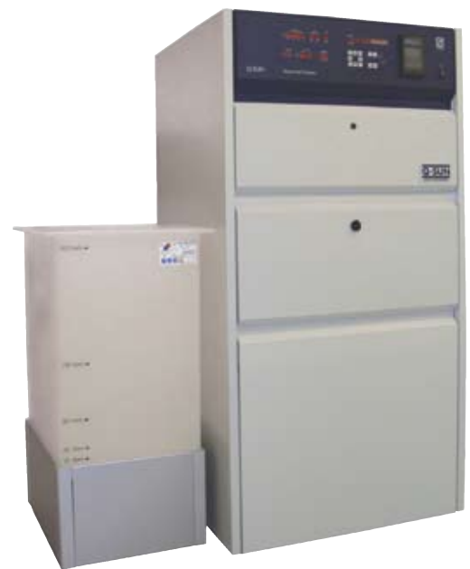
The Q-Sun Xe-3-HDS allows you to spray both water and an additional solution onto test specimens.

220-liter Reservoir. Holds a sufficient amount of a secondary solution for ease of operation. The reservoir cart is on casters for easy mobility and maintenance.